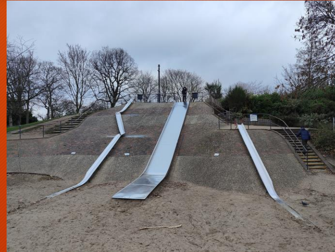
On this photo you can see the longest slide.